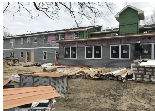
Siding goes up on the north-facing wall

By the time you read this, we will be in the throes of moving to the new wing. Our anticipated move will be the week of Feb. 18.