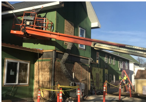
The new front entrance gets prepped for siding